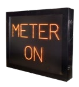
Blank Out LED Sign