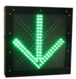
Lane Control LED Sign