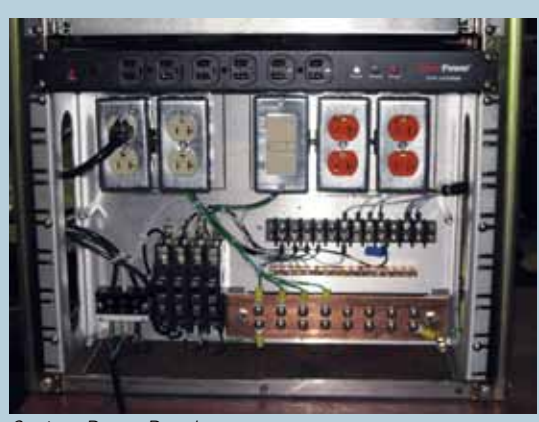
Custom Power Panel