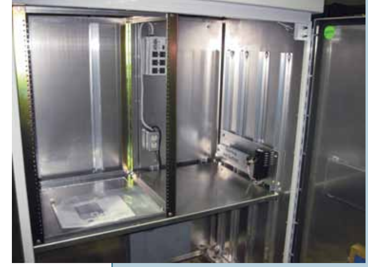
19" EIA rack in a NEMA type IV with unistruts